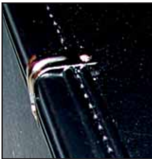
Sewn Edge Binding for Added Strength and Durability