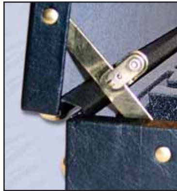
Metal Lid Stays