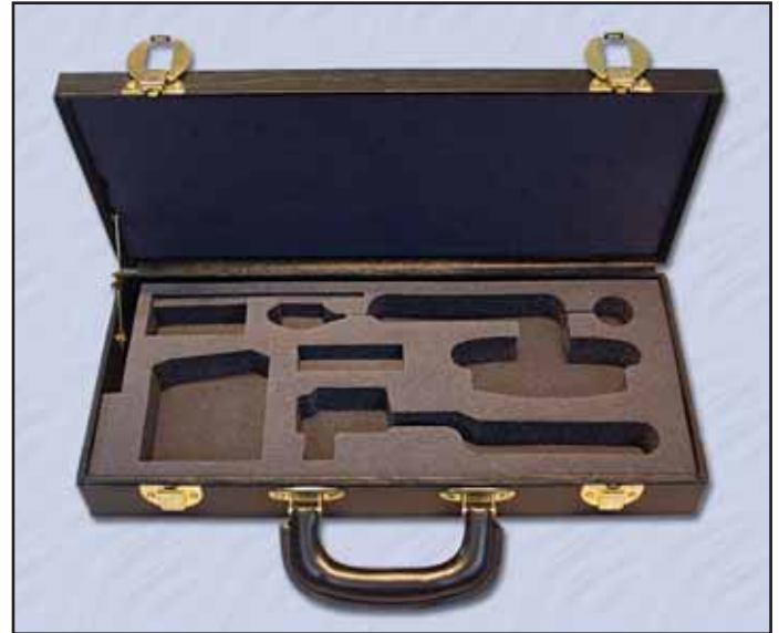
Custom Fitted Die-Cut Foam Interiors

* Please note – only a few of our hardware options are shown.