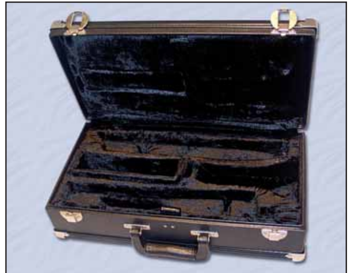
Plush, Fabric-Covered Fitted Interiors